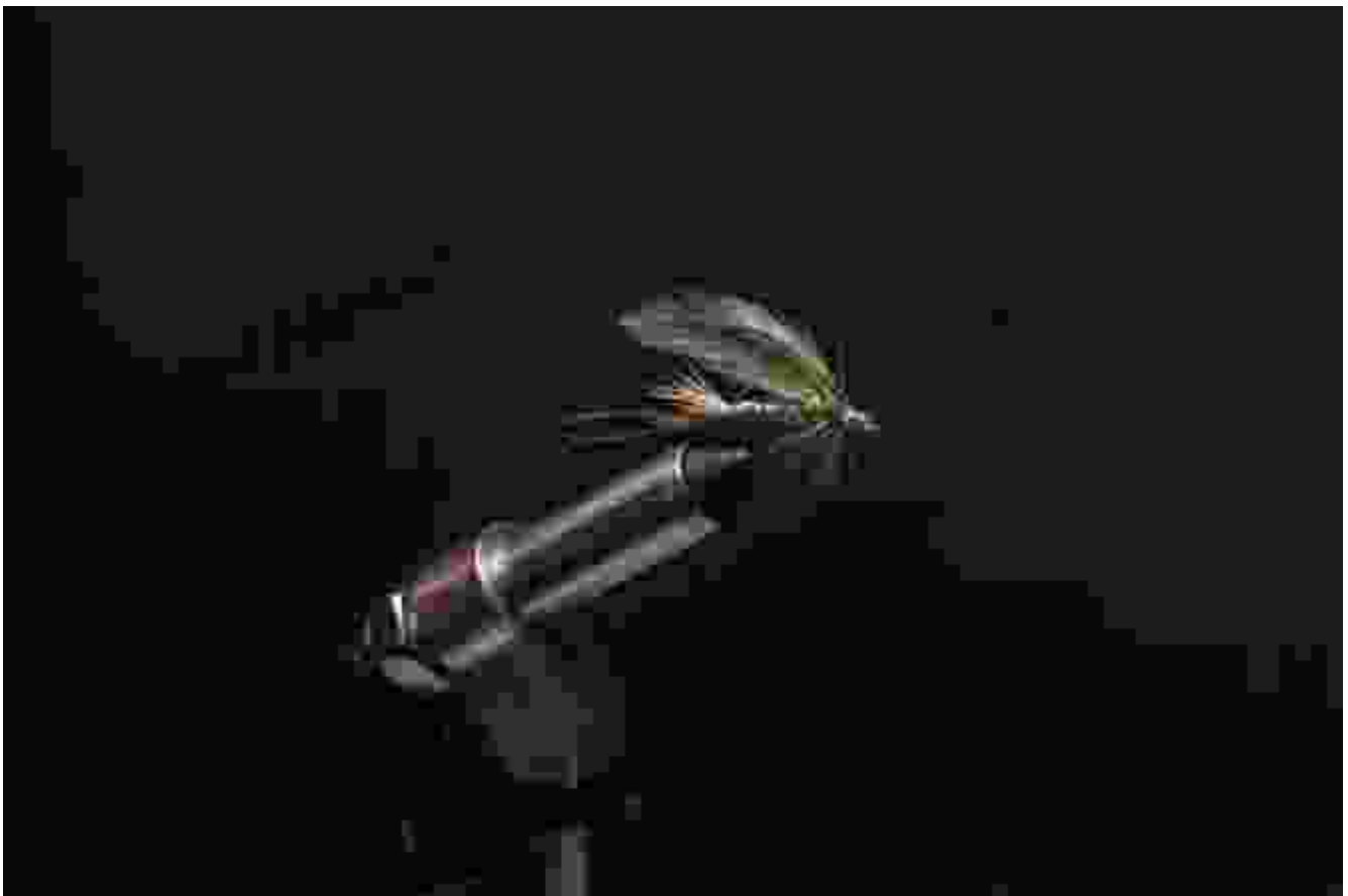
The intricate art of fly tying

Fly tying is an integral part of mountain fly fishing, allowing you to create custom flies tailored to the specific environment and target species. This intricate craft requires patience, precision, and an understanding of entomology.